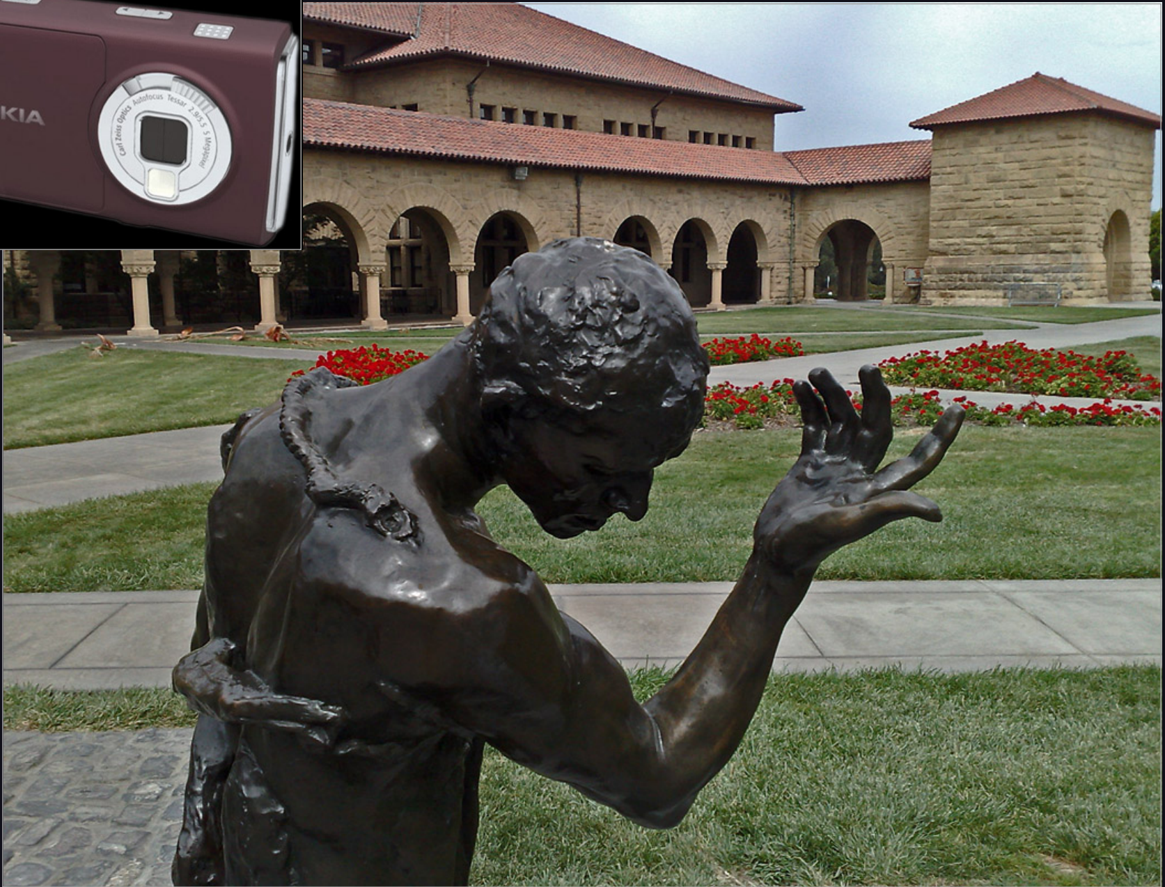
unretouched pictures from Nokia N95 (5 megapixels, Zeiss lens, auto-focus)